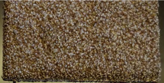
20170 Mountain West